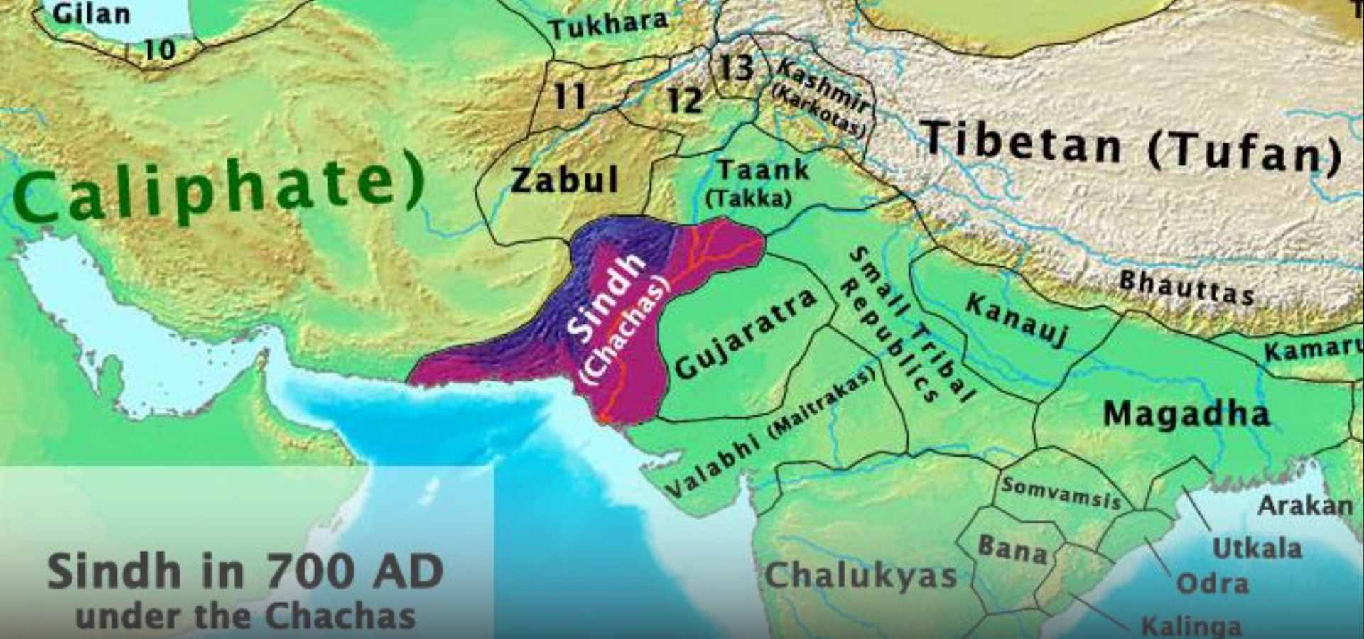
Sindh in 700 AD under the Chachas